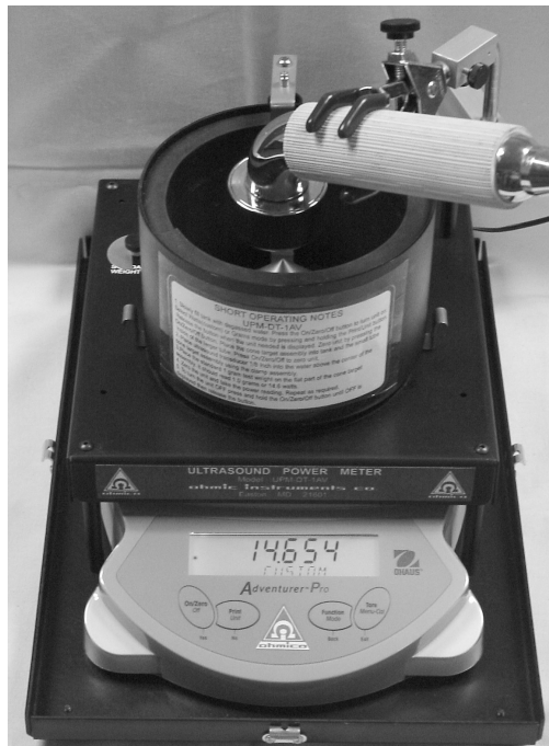
Front view of the UPM-DT-1&10AV. Shown is the electronic balance, base assembly, and test tank.

ALL COMPONENTS ARE AVAILABLE AS REPLACEMENT PARTS.