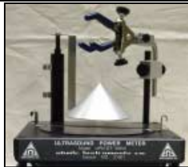
The cone target and transducer positioner. Tank not shown