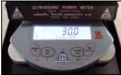
Front Display Panel