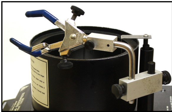
PREVIOUS CLAMP ASSEMBLY